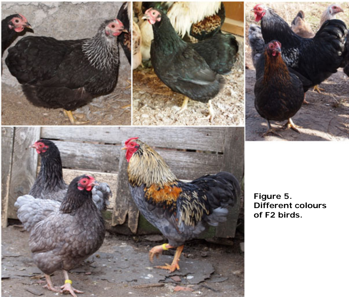
Figure 5. Different colours of F2 birds.

Of over 40 hatched chicks were only two females with salmon colour and a few