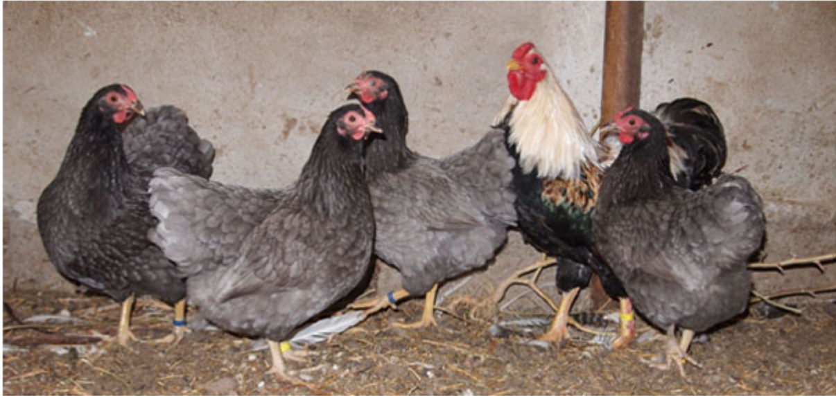
Figure 4. A breeding group for F2 birds.

I chose the best F1 blue females and gathered them with their father – the salmon Wyandotte bantam for the second backcross (Fig. 4). Here theoretically 50% of the chicks should be salmon or blue salmon colour, but actually there was a large degradation in the plumage colour in F2.