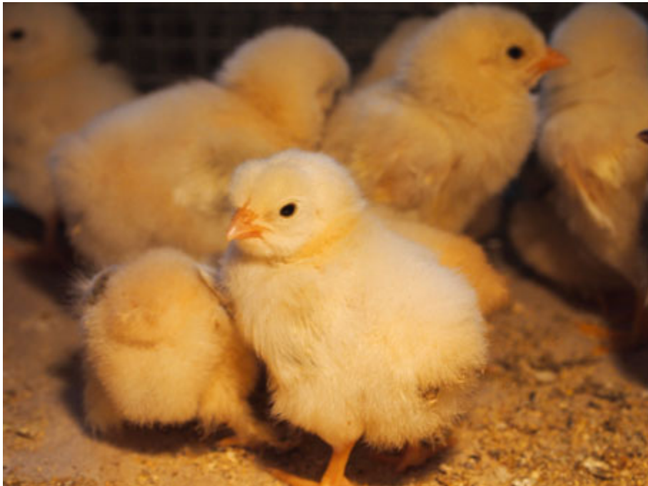
Figure 8. F4 salmon/blue salmon Wyandotte bantam chicks.

Today, this cock is sexually mature and I gathered him with his mother and aunt to get splash, blue and standard salmon F4 chicks. In the incubator there are more than 20 eggs of them and the collection continues. In the beginning of April I've hatched the first 12 F4 chicks (Fig. 8), so maybe there is some great blue or splash salmon bird, we will see .... I have also salmon Wyandotte bantams imported from Austria to cross with the possible splash or blue salmon birds from F3, where I can have the opportunity to make a selection and gradually improve both the exterior and the colour of birds.