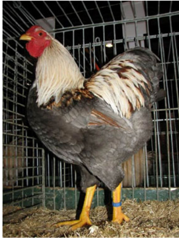
Above: Blue salmon Wyandotte rooster and hen.

The salmon colour is one of my favorite chicken colours. Over the years I had the standard and miniature Faverolle and a German type salmon Wyandotte bantam during the years. The thing that impresses me is the blue variety of salmon colour. As we know, the blue salmon colour is created and standardized only in Faverolle bantams.