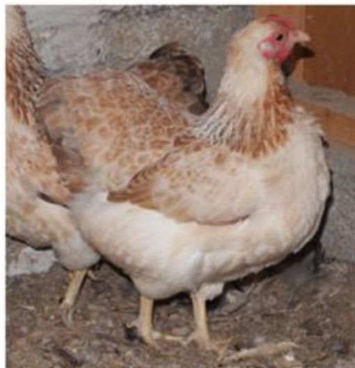
Figure 7. Blue salmon cockerel from F3 generation with salmon and blue salmon hens (Right) and blue salmon female (Left).

One of the brighter hens from F2 turned out to be a blue salmon colour and accidentally the hatched chick was her son, luckily the Bl allele which she wore in the heterozygous state was combined with wild-type allele from the salmon cock in crossover. A unique stroke of luck which was a happy ending of the string of bad luck.