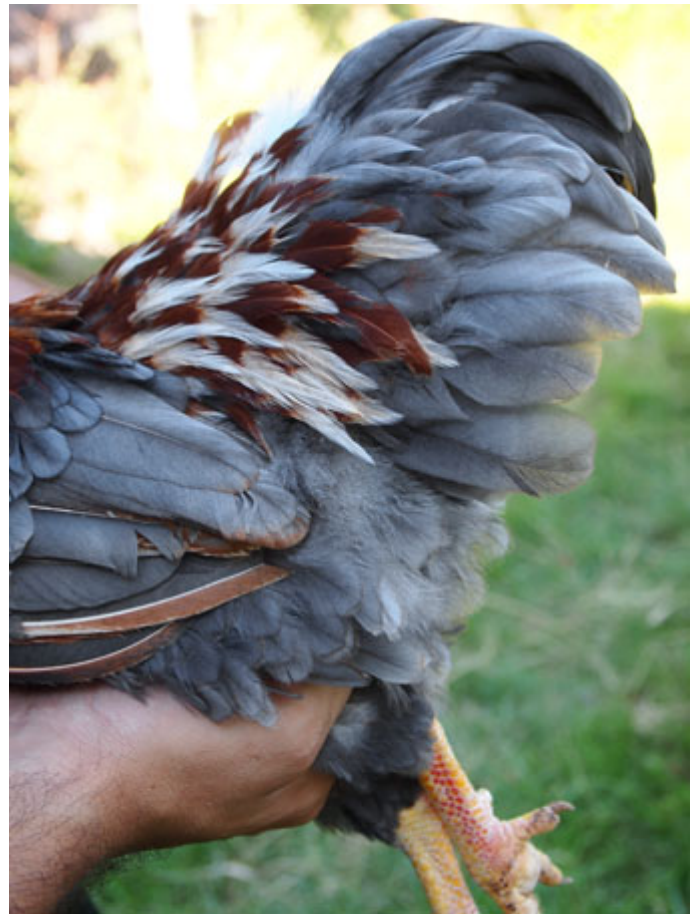
Below: Colour and marking of various blue salmon feathers.