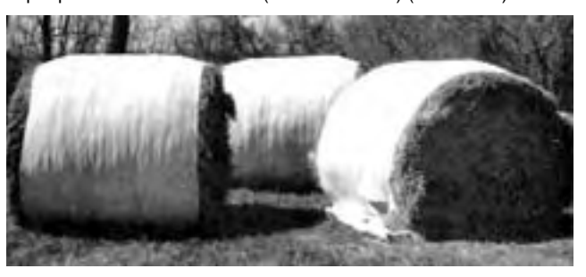
FIGURE 2. Round Bales Wrapped with Plastic and Stored in Field.

moisture content (15% MC) and wrap the following day. Bales, which were wrapped following these moisture content guidelines kept well. Storing the bales by butting them tightly against each other did not allow air to circulate between the bales and some spoilage from moisture accumulation between the bales occurred. Bales were best kept apart about 4 to 6 inches (100 to 150 mm) (FIGURE 2).