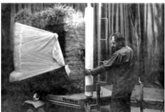
FIGURE 4. Applying Tension to Plastic Roll.

Knife: Ease of operation of the knife was very good. The knife performed well throughout the test. The knife consisted of a row of 16 sharp teeth mounted to a pivoting bar. Upon completion of the wrap cycle, the pivoting knife was moved towards the wrapped bale and into the plastic with the one hand, while the opposite hand operated the lever. It was important to keep the bale rotating to ensure a clean cut on the plastic.