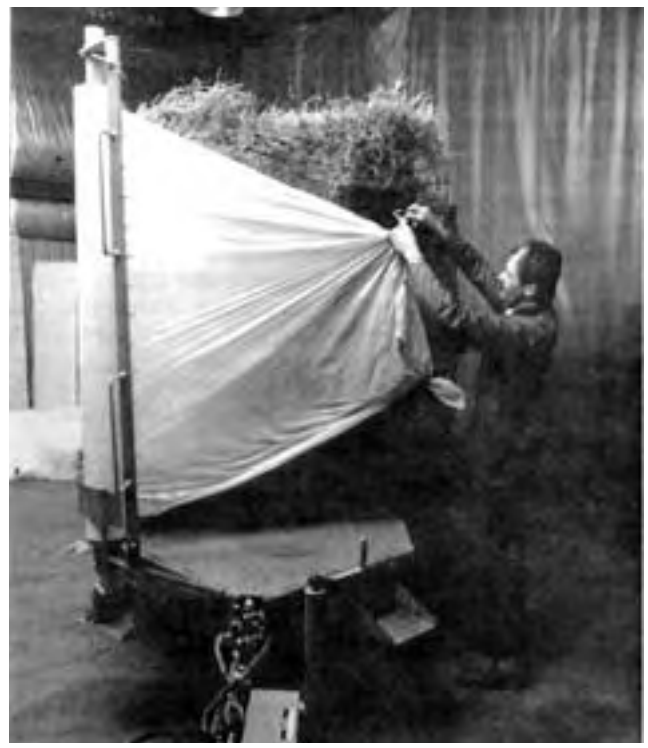
FIGURE 3. Tying the Plastic End to the Bale Strings.

The operator had to hold the brake in place with one hand until the knife assembly came into contact to insure proper brake orientation, otherwise the brake would occasionally turn around and wedge against the roll. The plastic roll would then stall and rip at the bale. It is recommended that the manufacturer consider modifying the brake to improve its ease of operation and performance.