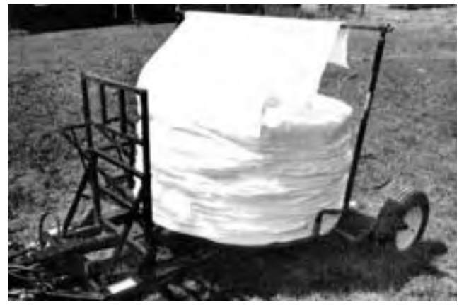
FIGURE 3. Installing Poly Tubing from Roll onto Drum.

Final preparation of the Rampak, which included sliding the tension ring over the drum and poly tubing and tying off the end of the poly tubing, took one man about 5 minutes. Bale twine wrapped several times and tied provided a sufficient seal against spoiling (FIGURE 5).