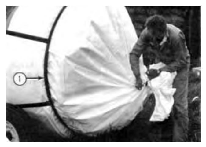
FIGURE 5. Poly Tubing Sleeve End Wrapped and Tied after Installation on Drum; (1) Tension Ring.

Loading: Ease of loading was very good. Round bales were loaded onto the carriage or placed onto the ramp with a frontend loader. Bale forks were adequate when the ramp was used while grapples allowed setting the bale directly onto the carriage. When using the bale ramp (FIGURE 2) the Rampak operator was occasionally required to assist the bale down the ramp. The ramp could be attached to either side of the Rampak to suit storage site access limitations.