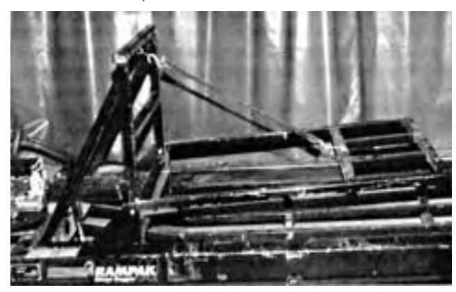
FIGURE 8. Drop Extension Rail Held Up With Tarp Straps.

Adjustments and Servicing: Ease of servicing was excellent. The Rampak required no adjusting throughout the duration of the test. Lubrication was required only on the ram guide wheels before operation. The manufacturer did not include any information on a recommended lubrication schedule.