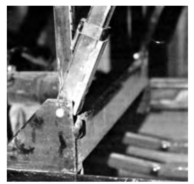
FIGURE 7. Reinforced Drop Extension Rail.