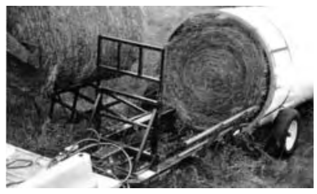
FIGURE 2. Bale from Expanding Chamber Baler being Set onto the Ramp.

Expanding chamber balers produced suitable well-formed bales for the Rampak. 'Round' bales, as opposed to ovated bales, were desired to optimize the capacity of the drum (FIGURE 2). Generally, operators would attempt to make bales very close to the diameter of the drum to effectively fill the bag. This aided in the bag weathering durability by helping to reduce air cavities within the bag and also provided a better return on the dollar invested per amount of hay stored.