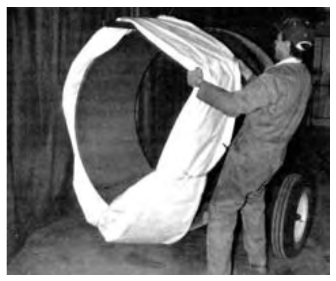
FIGURE 4. Installing Folded Poly Tubing onto the Drum.