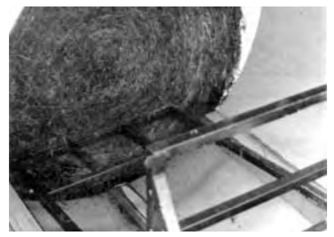
FIGURE 6. Bale Wedged Against Drop Extension Rail.

Drop Extension Rail: When the bag was filled to its capacity, the final bale was pushed clear of the drum with the drop extension rail. A stop on the rail was used to hold the extension rail about 12 in (300 mm) up on the bale. The stop caused the rail tubing to deform when used the first time. The bale pulled the extension rail down as the bale dropped to the ground from the drum (FIGURE 6). Repairs were made to the stop, however, the tubing again deformed (FIGURE 7). Eventually, tarp straps were used on the rail to permit it to spring back into its held up position after the bale was pushed through (FIGURE 8). It is recommended that the manufacturer consider providing a more durable method of holding the drop extension rail up when discharging the final bale from the drum.